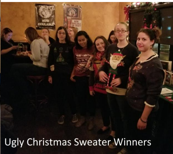
Ugly Christmas Sweater Winners